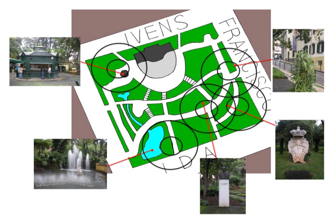
Figure 1. Municipal Gardens in Funchal, Madeira. Still images of the landmarks and illustration of proximity and activation zone per landmark.

A sound garden [1] is a virtual audio environment composed of a set of precisely situated sounds spatially overlaid on an urban park. Using GPS or WIFI technology, the position of users in relation to specific audio landmarks is tracked and information related to their proximity to these landmarks is presented. A sound garden is usually intended for users to casually explore and experience rather than navigate via predefined paths. The unstructured nature of this activity presents unique challenges for the design of audio feedback to support exploration. Fundamentally, individual landmarks need to advertise themselves both to attract the user's attention and support subsequent targeting. This is typically achieved using an acoustic beacon-sounds which activate when a user is within a specific distance from a landmark [2]. Two concentric levels of beaconing feedback are beneficial, the first in a wide proximity zone and the second in a narrower activation zone. The goal of audio cues in the proximity zone is to provide unobtrusive audio guidance, which enables a user to move towards the activation zone. Once this inner zone is successfully reached, additional content is made available to the user, either to indicate that a landmark has been found or to provide structured information describing it. Beyond other design considerations, the size of these zones is influenced by the accuracy of the tracking technology: larger errors (e.g. conventional GPS) require larger zones for